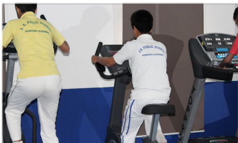
well equipped gymnasium